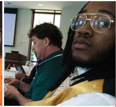
Martin Short networks.