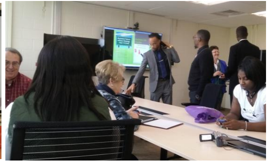
Center for Entrepreneurship hosts Friday workshops.