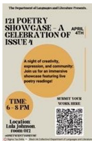
121, ΣΤΔ, & BIC