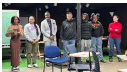
Black Ink Collective Farewell Event 17 April 2025