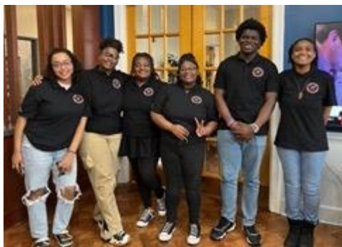
VSU Yearbook Photo 6 March 2025