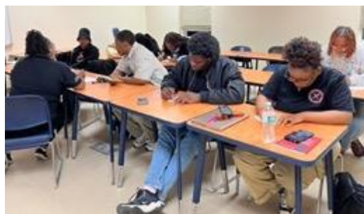
Black Ink Collective 6 March 2025