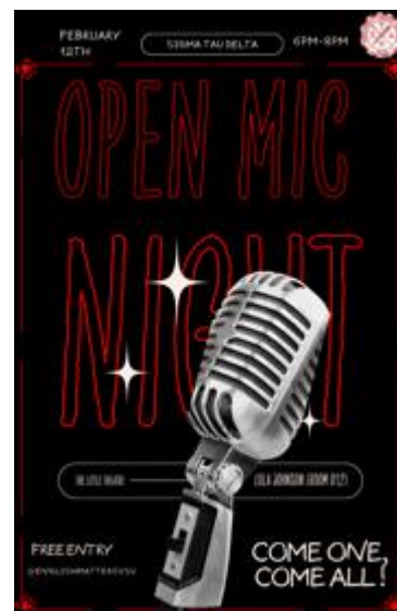
Open Mic Night 12 February 2025