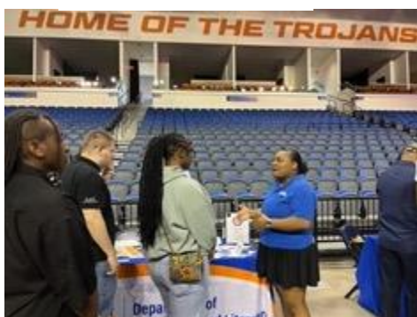
VSU Open House 29 March 2025