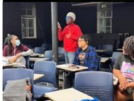
Poe Party: Impromptu Ekphrasis Haiku 7 November 2024