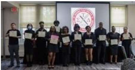
Spring 2025 Sigma Tau Delta Induction Ceremony