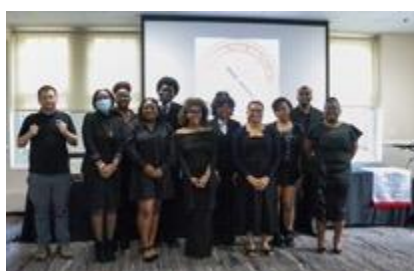
The Sigma Tau Delta candidates were inducted.