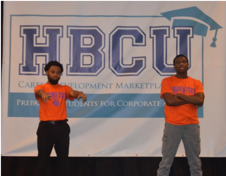
Students visited Baltimore for the HBCU Marketplace.