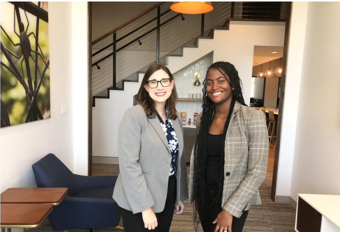
Faculty and Staff celebrate camaraderie. Above.