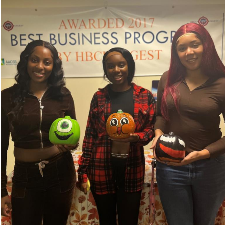
The ladies celebrated Halloween by hosting a pumpkin painting contest.