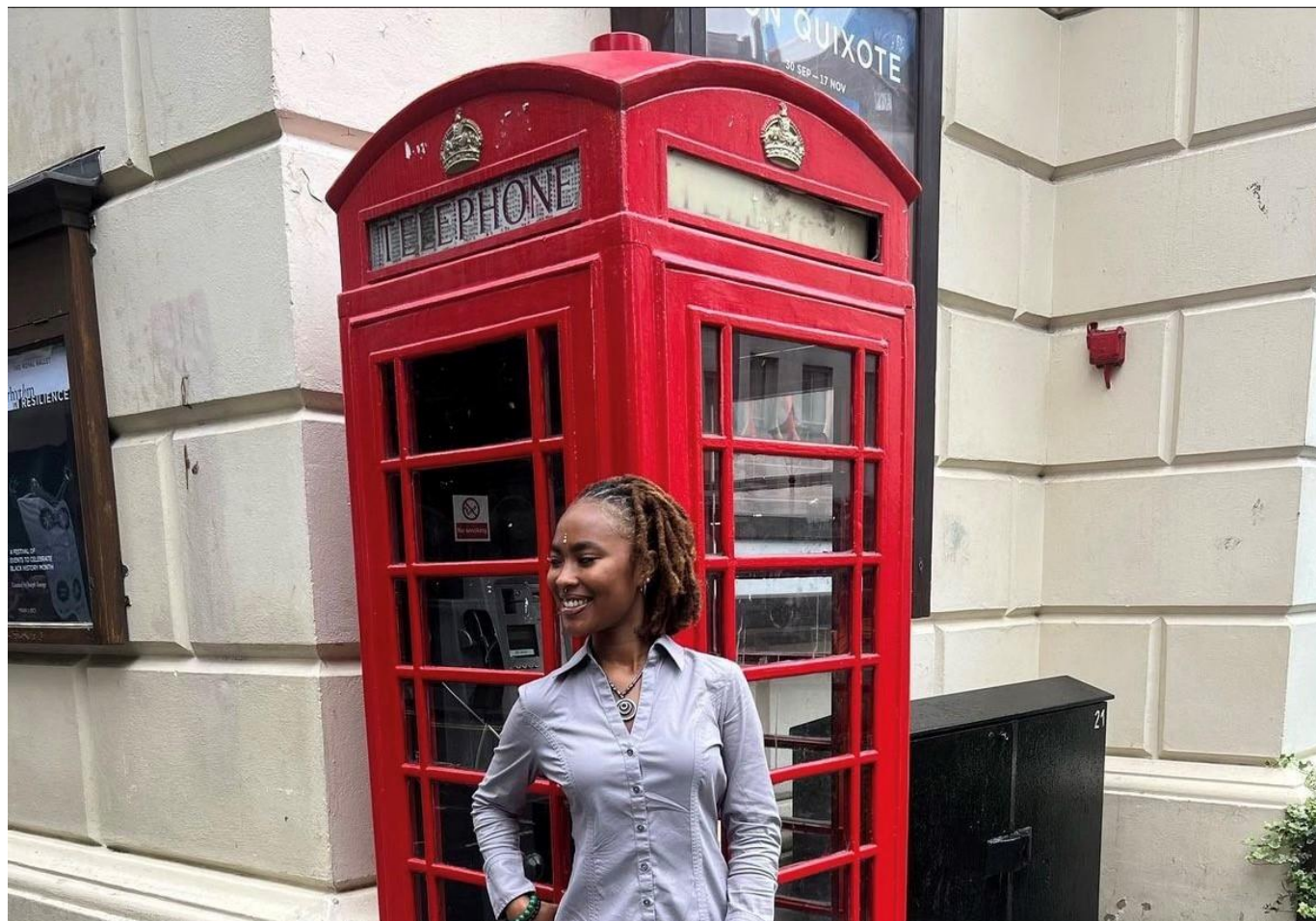
This newsletter is dedicated to the students and faculty that participated in the College's Center for Entrepreneurship visit to London and Paris.