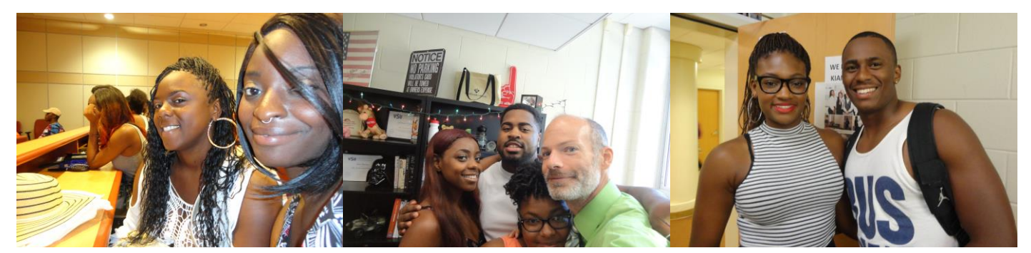
Orientation session for freshmen is all smiles!