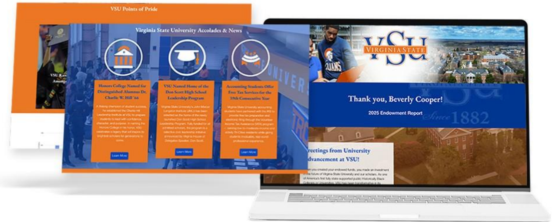
New Digital Personalized Endowment Report