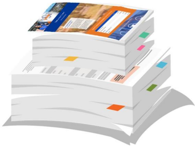
Old Paper Endowment Report