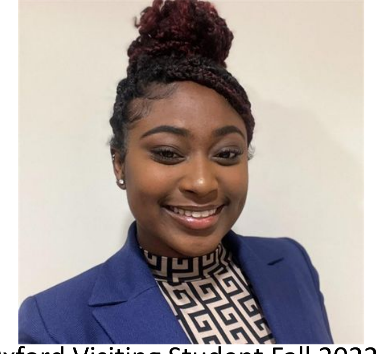
Oxford Visiting Student Fall 2022