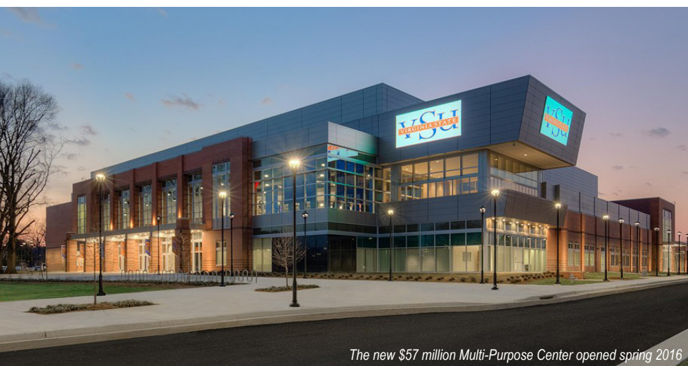
The new $57 million Multi-Purpose Center opened spring 2016