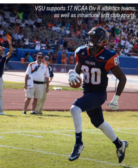
VSU supports 17 NCAA Div II athletics teams, as well as intramural and club sports.