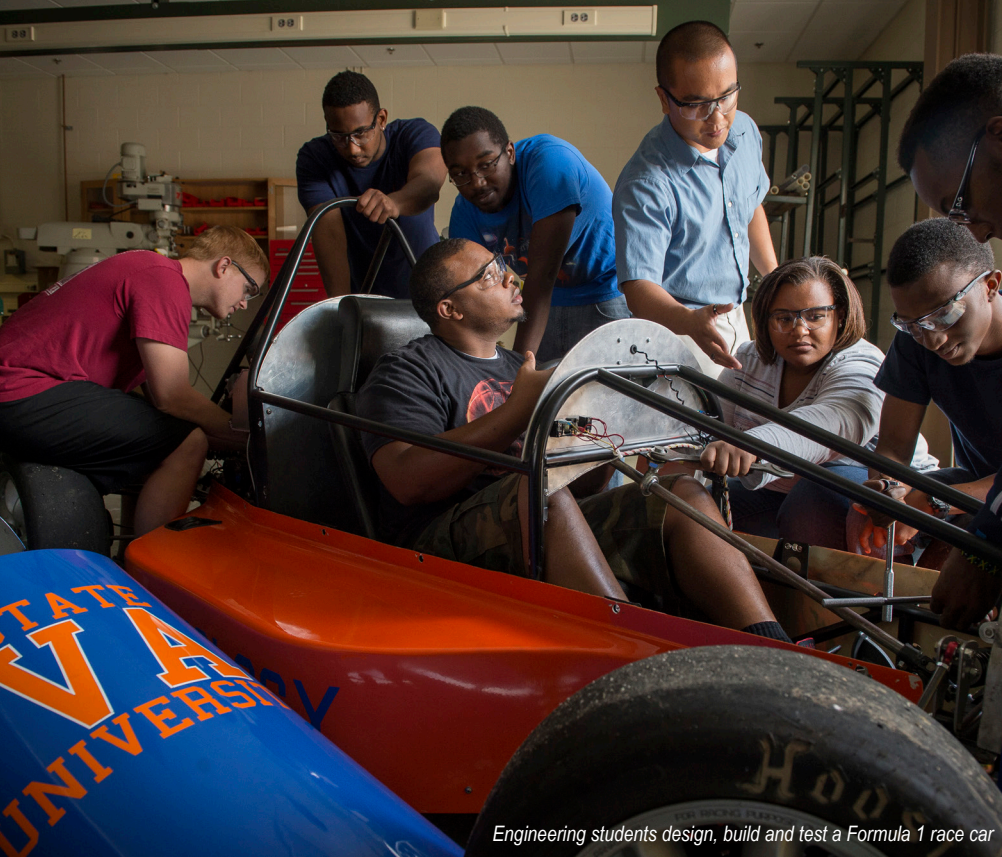
Engineering students design, build and test a Formula 1 race car