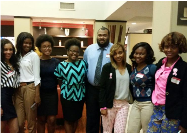
Students participate in Shamin Hotels Breast Cancer Awareness Event.