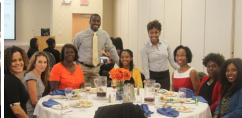
Students at Dynex Capital Luncheon.