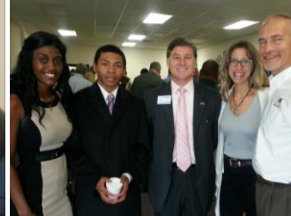
Networking session in Colonial Heights.