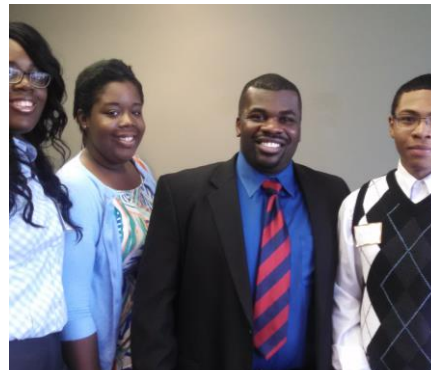
Students participate in Ribbon Cutting in Hopewell.