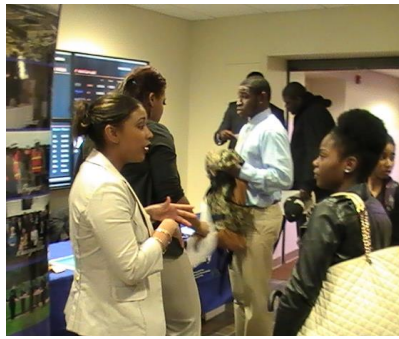
U.S. Army Audit Agency Day at VSU.