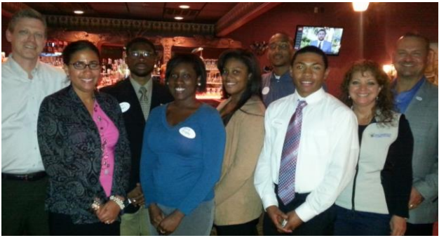
Students participate in a Young Professionals Networking Event.