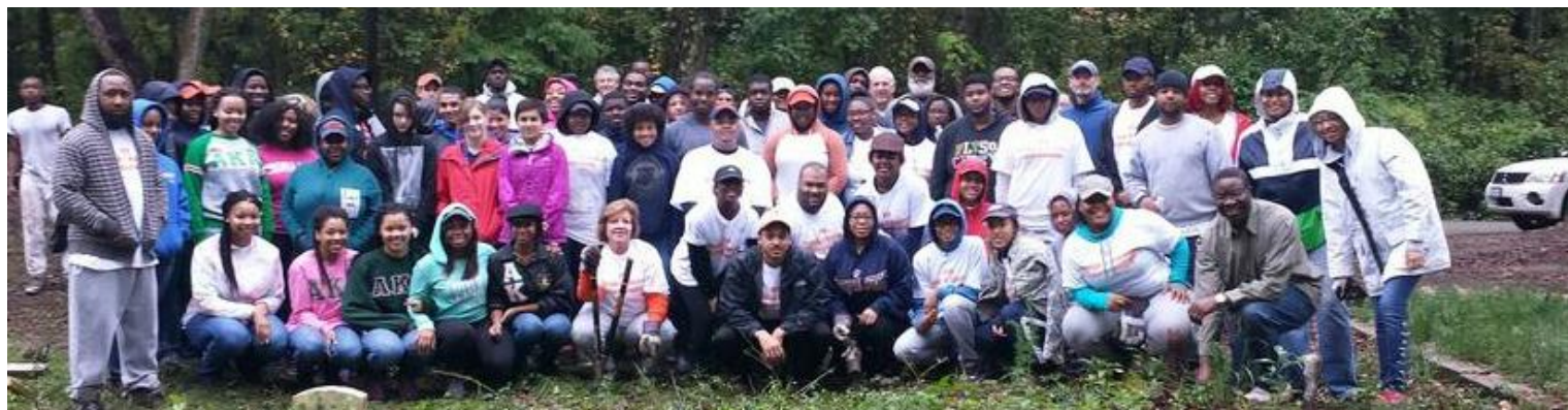
The College of Business leads a transformative cleanup at Evergreen Cemetery.