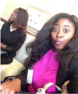
Project Shadow at NBC.