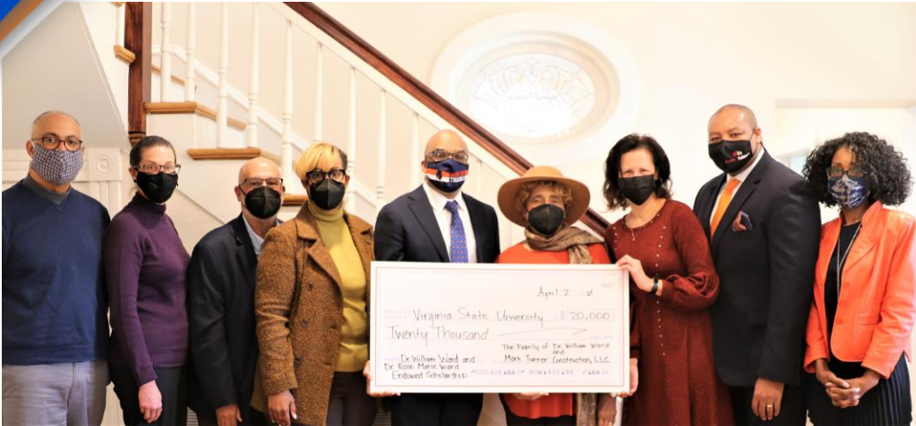
Dr. William Ward and Dr. Rose Ward Endowed Scholarship Fund - $20K